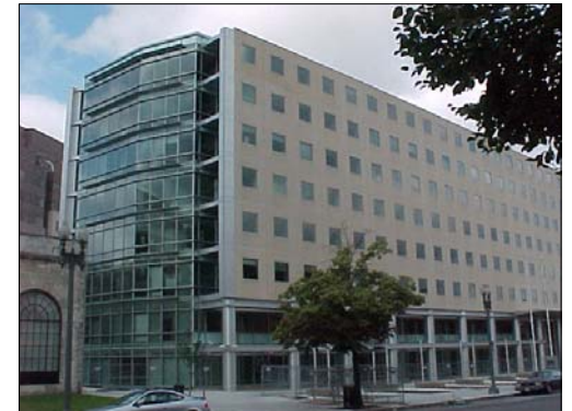
20 Massachusetts Avenue Building Renovations